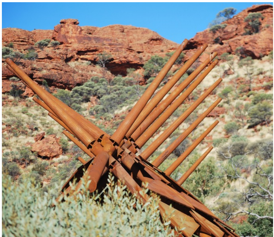
Watarrka National Park Visitor Information Shelter 2016 Parks and Wildlife Commission of the Northern Territory and Watarrka Traditional Owners

Tangentyere Design's work has been honoured by its peers, receiving numerous Australian Institute of Architects awards and commendations.