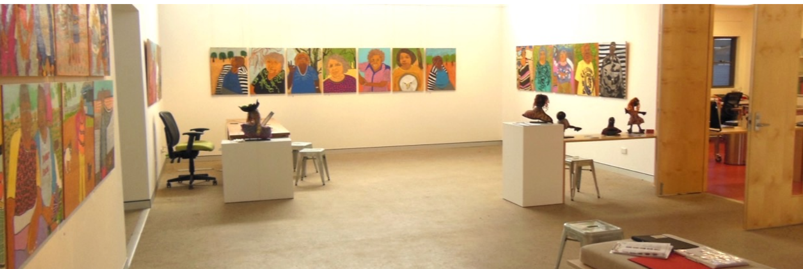
Tangentyere Artists Studio and Gallery 2014 Tangentyere Artists

Tangentyere Design regularly offers architectural advice on a pro bono basis to Town Camp residents, and to the social service divisions at Tangentyere Council. This may take the form of report and grant application writing, design workshops and preliminary costings for proposed capital works.